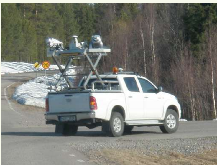
Vehicle with Equipment for roads networks (Technique for Road Network Diagnosis)

In so doing, the Road Doctor survey van from Finland was one among the options that were assessed and it proved to be economical and best option