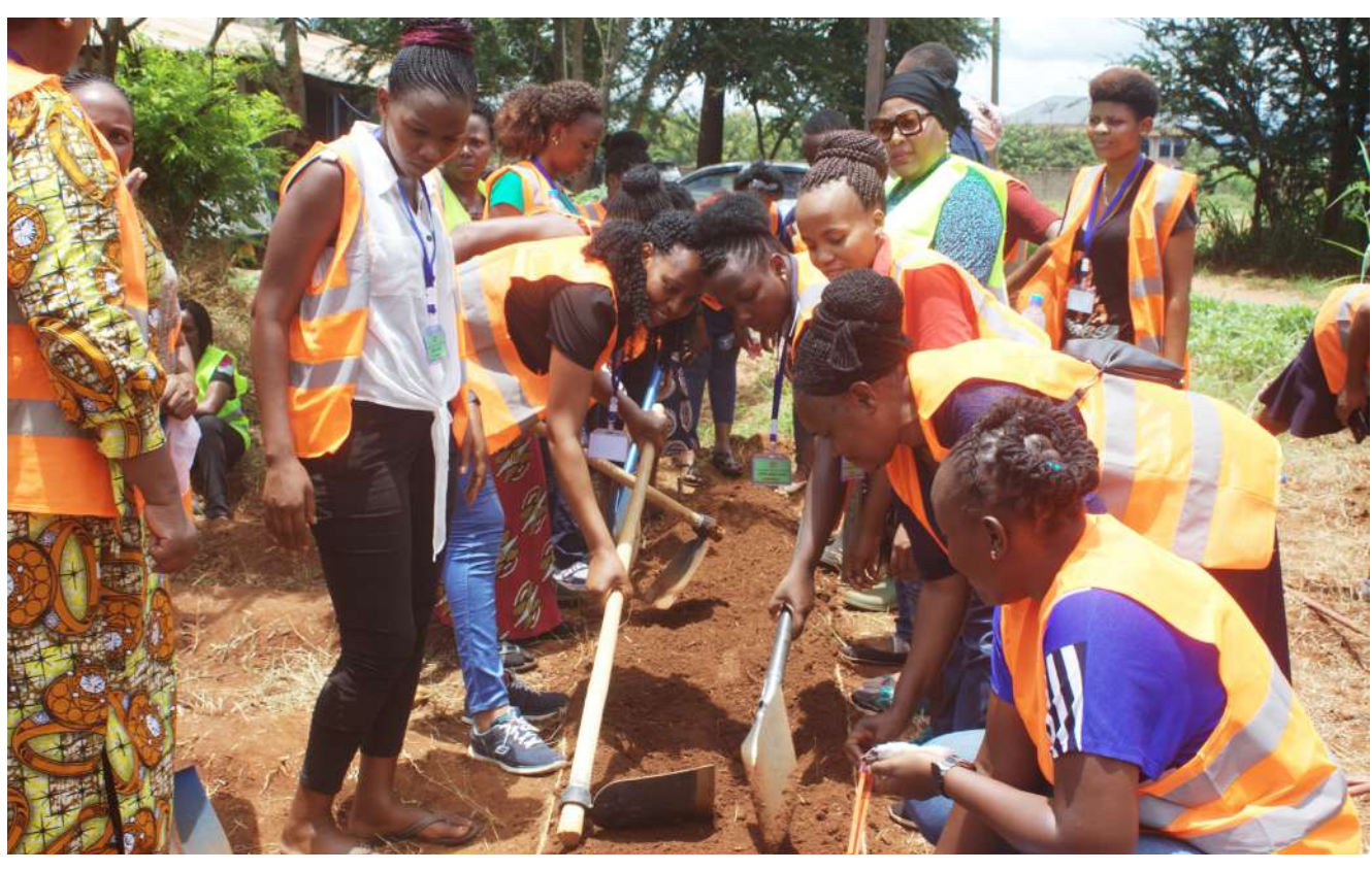
Participants for the training to empower women in road construction work using Labour Based Technology (LBT) takes part in road construction in Morogoro.

Therefore. women empowerment not only leads to a decrease of unemployment rate in a country but reduces poverty as well while at the same time enhancing human life standard.