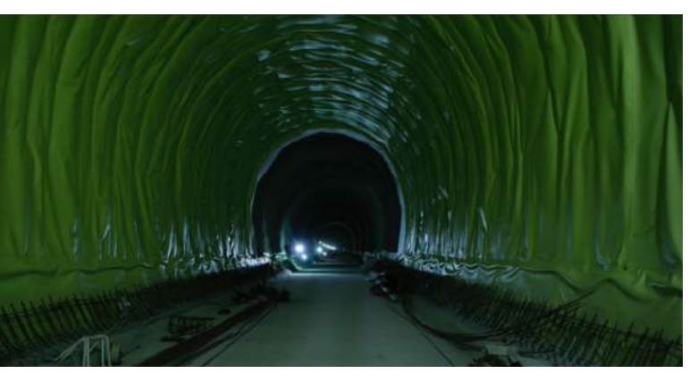
The inside part of the Standard Gauge Railway Tunnel in Kilosa, Morogoro.

He said the design and build contract for LOT 1: Dar es Salaam - Morogoro (300 km) which is being undertaken by M/s Yapi Merkezi is progressing well and already 70 per cent of the project has been completed.