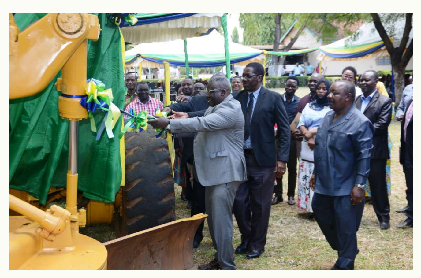
The Permanent Secretary in the Ministry of works, Transport and Communication (Works sector) Arch. Elius Mwakalinga (first L) cuts a ribbon as a sign to launch and handover learning equipment to Morogoro Works Training Institute (MWTI).

Such a move is in line with the ministry's construction policy of 2003 and its reforms since 2000 which envisages strengthening the construction industry policies and creation leaislations. of an enablina environment for provisions and upgrading of appropriate technical training technological applied research.