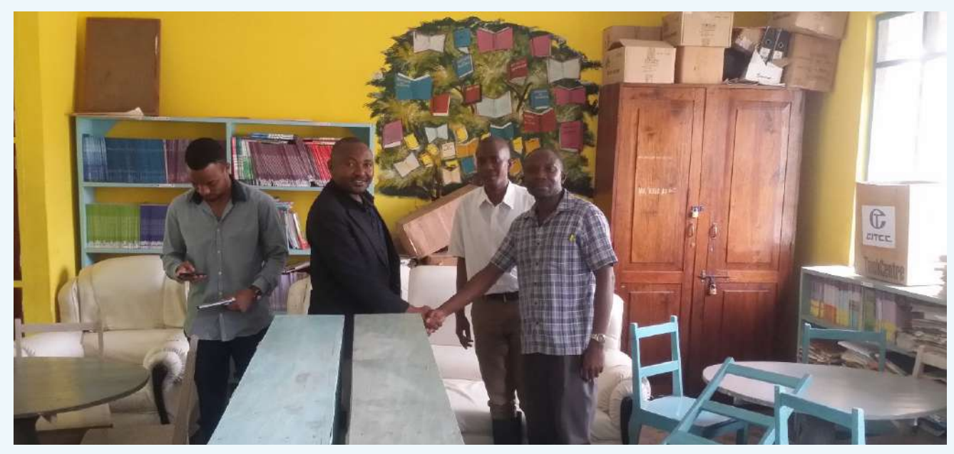
TanT<sup>2</sup> Centre staff during a visit to Msasani primary school in Dar es Salaam which is among the schools earmarked for the program.