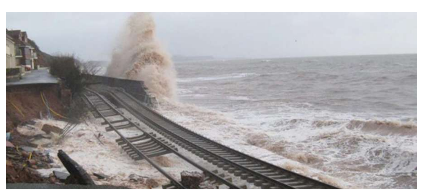
Effects of Climate change to the infrastructure (Climate resilient)