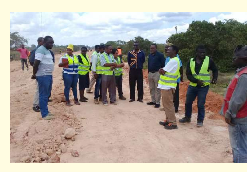
On-job-trainees for Mtwara Mnivata road project