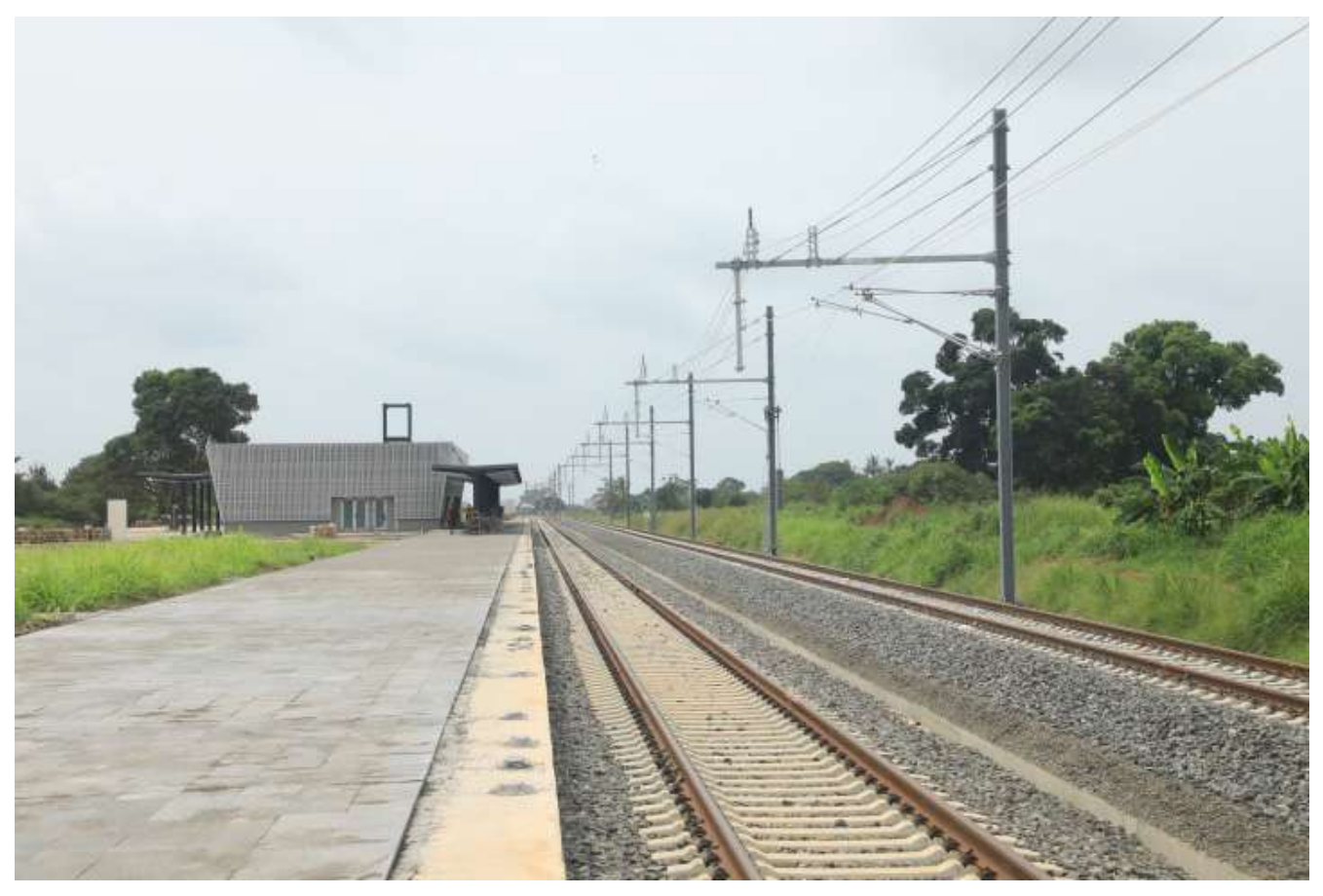
The Standard Gauge Railway Station at Soga.

The first phase consists of six stations at Dar es Salaam, Pugu, Soga, Ruvu, Ngerengere Morogoro. The Dar es Salaam and Morogoro stations will be main stations.