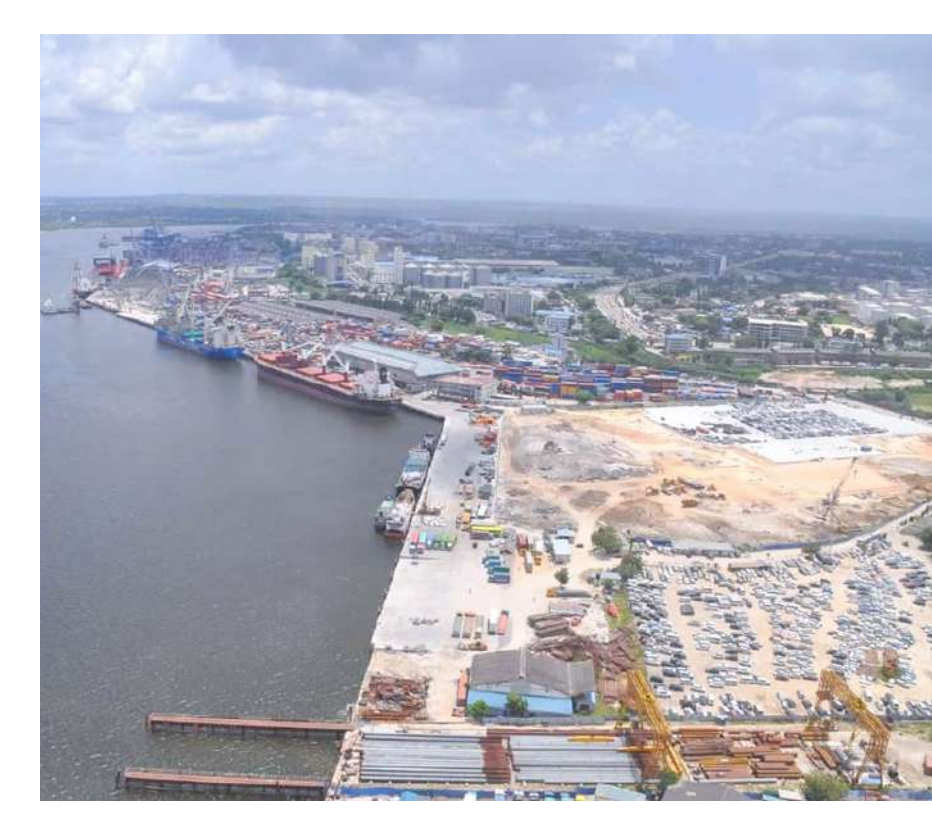
Construction of New Berth at Dar es Salaam Port.

For integration and connectivity of modes of transport, construction of SGR is going simultaneously with expansion of Dar es Salaam Port.