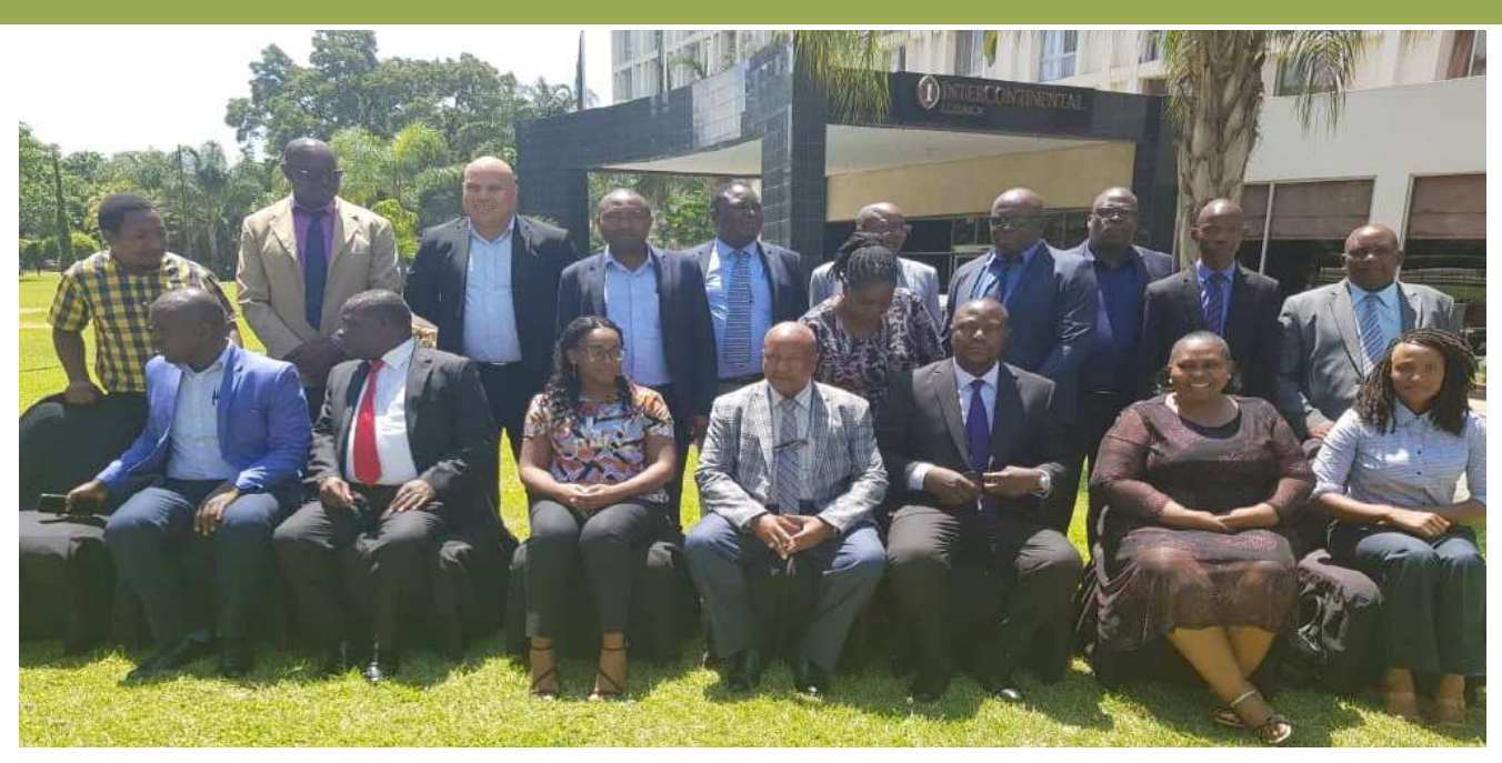
Participants of the 35th session of ASANRA committee and board meeting held on 18th - 22nd November, 2019 at the Atintercontinetal Hotel in Lusaka, Zambia.